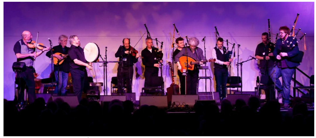
Tannies 50th Anniversary Reunion Concert Celtic Connections 2018

As they tour their 51st year, the Tannahill Weavers are firmly established as one of the premier groups on the concert stage. From reflective ballads to footstomping reels and jigs, the variety and range of the material they perform is matched only by their enthusiasm and lively Celtic spirits.