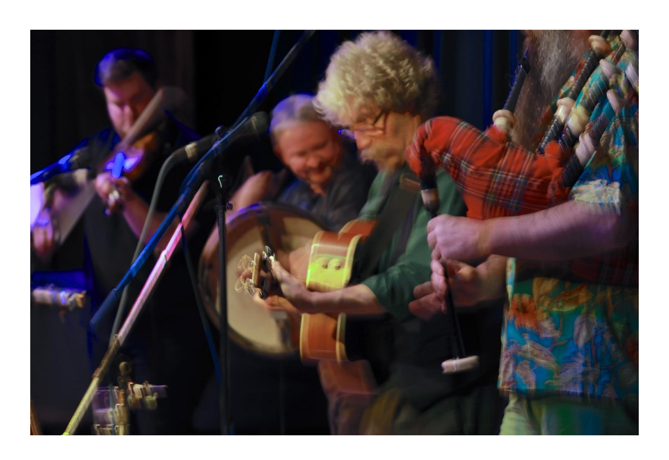
"...an especially eloquent mixture of the old and the new..." NEW YORK TIMES

Now in their 51st year, the Tannahill Weavers are one of Scotland's premier traditional bands. Their diverse repertoire spans the centuries with fire-driven instrumentals, topical songs, and original ballads and lullabies. Their music demonstrates to old and young alike the rich and varied musical heritage of the Celtic people. These versatile musicians have received worldwide accolades consistently over the years for their exuberant and humorous performances and outstanding recording efforts that seemingly can't get better...yet continue to do just that.